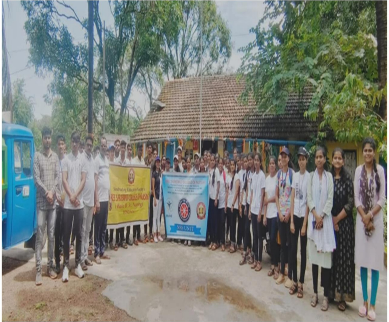
Participation of Principal Madam and Teaching Staff in Swachha Bharat Abhiyan.